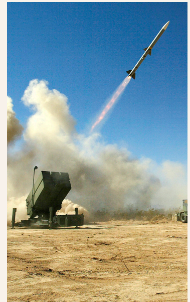
Excellent performance in time critical fire support applications