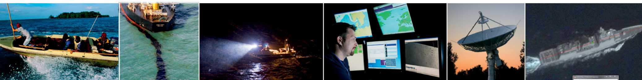
■ 2. and 3. QuickBird, swath width 16,5 km, resolution 60 cm. © COPYRIGHT 2010 DigitalGlobe