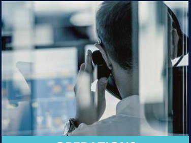
OPERATIONS & ADVISORY