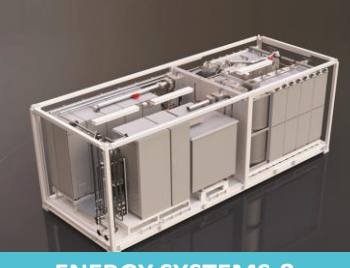
ENERGY SYSTEMS & MANAGEMENT